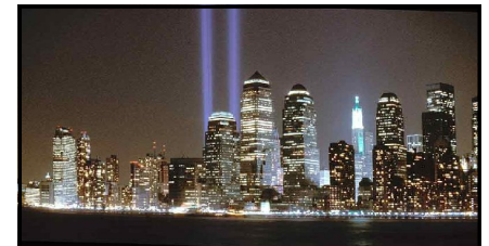
Lights At Ground Zero