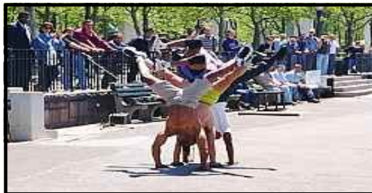
Acrobats entertaining those waiting in line to enter Ellis Island