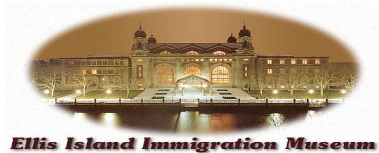
Ellis Island Immigration Museum

Price Includes: 3 nights, 2 days, all meals, 1 set of linens per person per stay, and the entire above package. Airport shuttle service available at an additional charge.